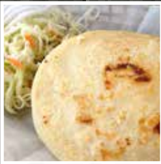
Flor de Izote